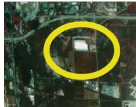
Figure 1. The R.C. Wiley Furniture Warehouse, Salt Lake City, clearly is visible in this aerial photograph.

However, the answer is not quite as simple as it may first appear. Winter days are shorter than summer days, with more overcast skies. More important, the sun is much lower on the horizon during winter and generates much less heat. As seen in Figure 3, in northern states, winter solar irradiance typically is 20 to 35 percent of the