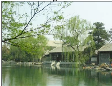
Figure 5. Administrative Area of Tsinghua University