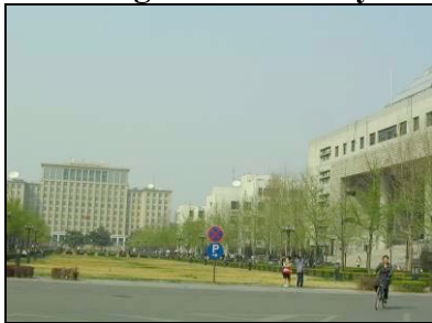
Figure 4. Teaching Area of Tsinghua University