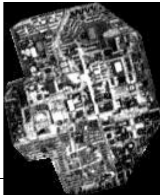
Figure 2. The Image of NDVI Taken by ASTER Satellite