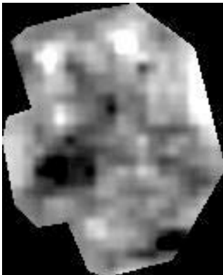
Figure 1. The Image of Brightness Temperature Taken by ASTER Satellite