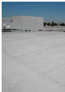
Coating for a low-sloped roof