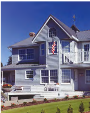
A residential cool roof

The Cool Roof Rating Council (CRRC), at www.coolroofs.org , is the sole entity the California Energy Commission recognizes for certifying the solar reflectance and thermal emittance values of roofing products. Only reflectance and emittance values listed within the CRRC’s Rated Products Directory may be used to meet cool roof requirements. Products that meet CRRC certification requirements will feature the CRRC label.