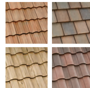
Cool Roof tile samples