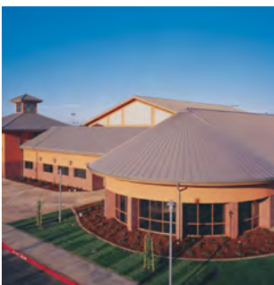
A nonresidential cool roof