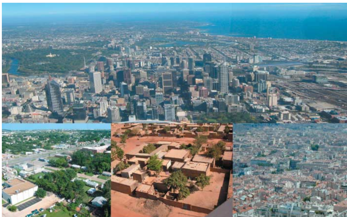
Plate 1 Photographs by the author of Melbourne, Australia (top); Oklahoma City, USA (lower left); Ouagadougou, Burkina Faso (lower middle); and Marseille, France (lower right) to illustrate variations in materials and morphology of urban landscapes both within and between cities. These result in distinct spatial and temporal patterns of urban warming

The radiative, thermal and hydraulic properties of construction materials differ markedly from those of bare rock, soil, vegetation and water, their pre-existing counterparts. In many, though not all, cities the area covered by vegetation decreases. Thus the fraction of solar energy driving evapotranspiration (the latent heat flux), rather than warming the urban fabric and air (the sensible heat fluxes), decreases. However, the properties of building materials differ widely (Plate 1). For example, roofing materials – asphalt tiles, ceramic tiles, thatch, slate, and corrugated steel/iron – have very different radiative properties (albedo, emissivity) and conductive properties (thermal admittance, conductivity) which greatly affect energy uptake and release and thus heating/cooling patterns. Other facets of buildings, for example, walls, are constructed of materials with equally different properties, which have profound effects on heating and cooling patterns and the resulting building and air temperatures.