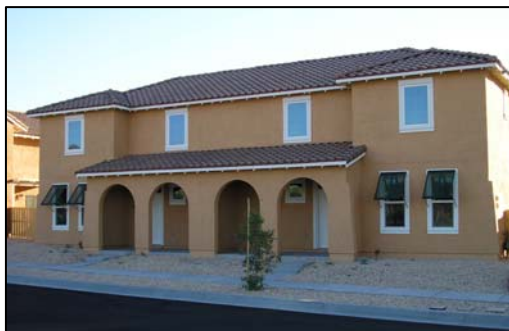
Privatized housing at Fort Irwin

ORNL is collaborating with the U.S. Army and several industry partners to showcase cool roofs that mitigate heat gain by high reflectance and new ventilation schemes through a study at Fort Irwin in Southern California. All costs for actual roof construction are borne by roofing manufacturers and the base housing budgets.